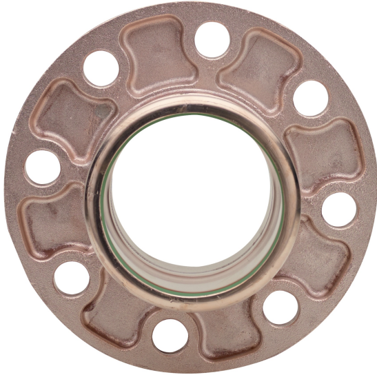
Manicotto femmina flangiato PN10/16.