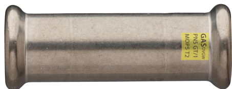
Manicotto passante F/F.