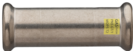
Manicotto passante F/F.