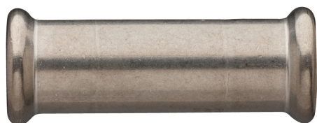
Manicotto passante F/F.