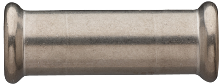
Manicotto passante F/F.