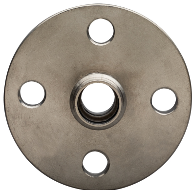
Manicotto femmina flangiato PN10/16.