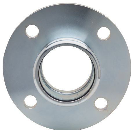
Manicotto flangiato F PN16.