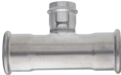
F/F/F reducing tee.