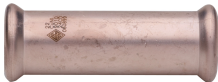
Manchon de connexion.