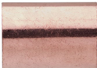
Manchon coulissant F/F.