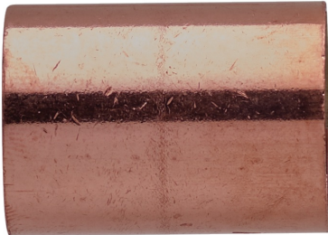
Manchon avec flexion F/F.