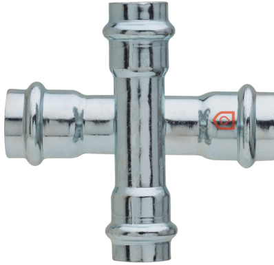
Croix désaxée F/F/F/F.