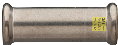
Manchon coulissant F/F.