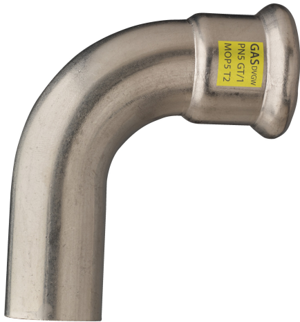
Courbe 90° M/F.