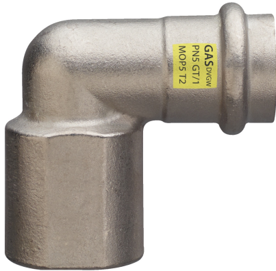
Coude F/filetage femelle.