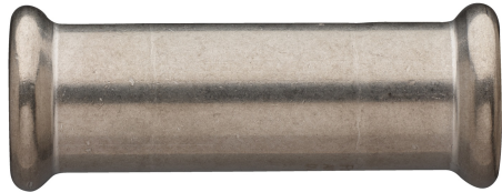
Manchon coulissant F/F.