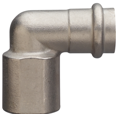
Coude F/filetage femelle.