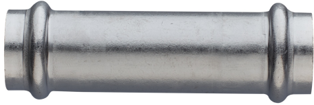
Manchon coulissant F/F.