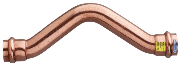
Chapeau de gendarme F/F en cuivre.