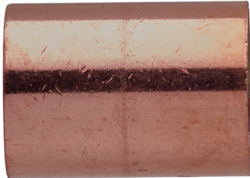
Manguito con remante H/H.