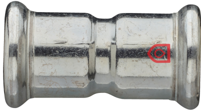
Manguito con remante H/H.