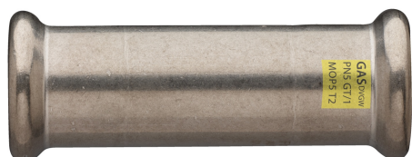
Manguito de paso H/H.