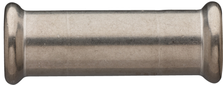
Manguito de paso H/H.