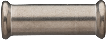
Manguito de paso H/H.