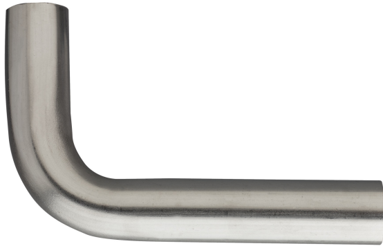
Curva 90° M/M.