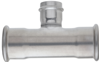
T reducido H/H/H.