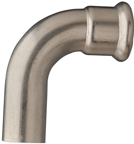
M/F 90° elbow.