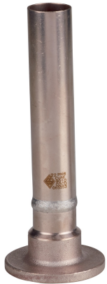
Collar for loose flanges PN6-PN10/16.