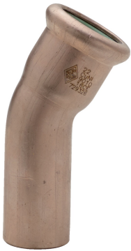
M/F 30° elbow.