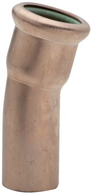
M/F 15° elbow.