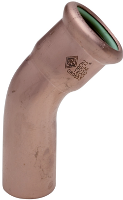
M/F 45° elbow.