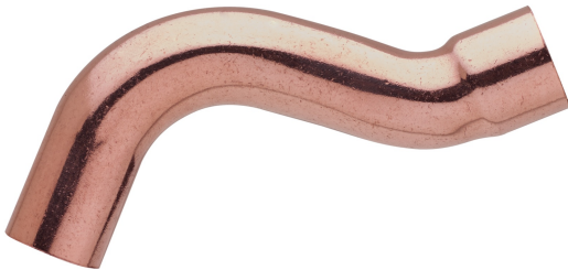
M/F partial crossover.