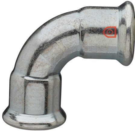
F/F 90° elbow.