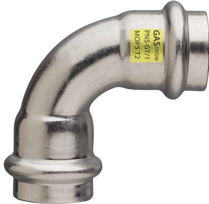
F/F 90° elbow.