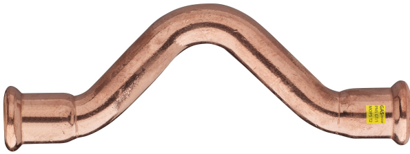
Copper F/F full crossover.