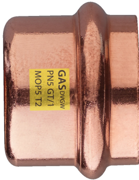
Copper F plug.