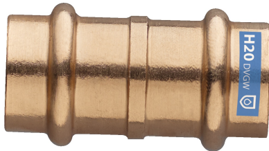
Bronze F/F adapter.