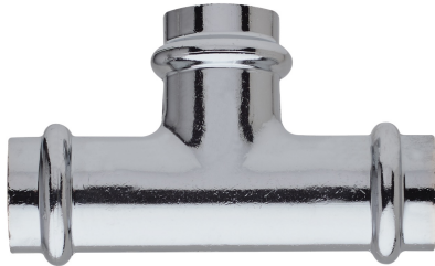
T-Stück I/I/I aus Kupfer.