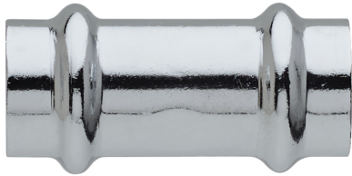
Muffe I/I aus Kupfer.