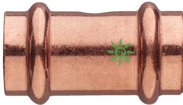
Muffe I/I aus Kupfer.