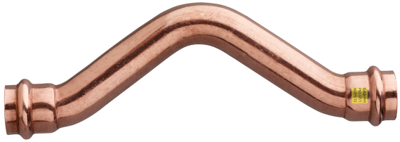
Überbogen I/I aus Kupfer.