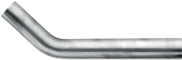
Gebogene Rohrstücke A/A 45°.