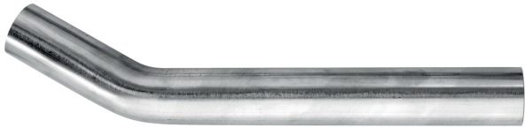
Gebogene Rohrstücke A/A 30°.