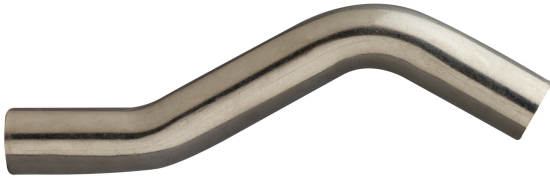
Überbogen kurz A/A.